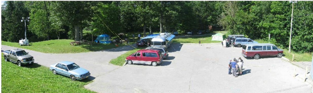
Reservoir Park, Bryon - Field-Day 2005 - June 25 th & 26 th